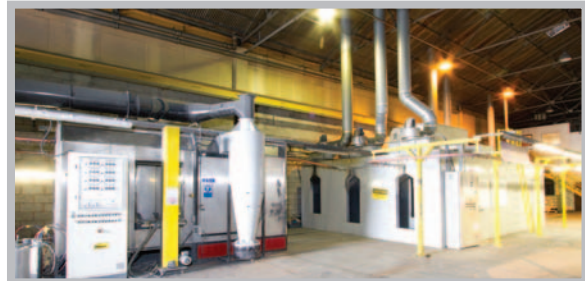
Main plant overview