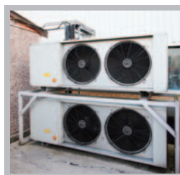
Air conditioning units