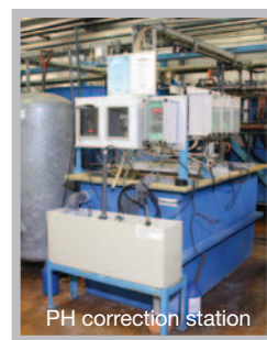
PH correction station