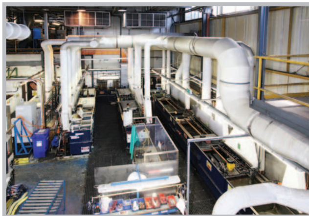
Plating line overview