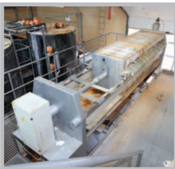
TT079SJ Flocculation, & Dewatering Filterpress Installation