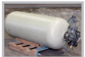
Water softening plant