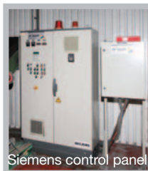
Siemens control panel