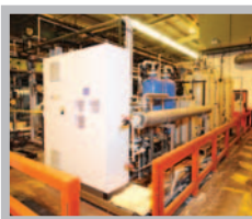
Acid recovery plant

Many more items to be added in the near future, including: