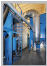
Pressure pots and dust extraction system