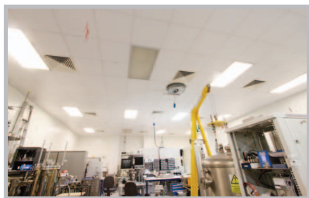
Suspended ceiling with air distribution

Originally supplied at an installation cost of over £800,000. Available from mid July 2015 with a removal latest date of Sept 2015.