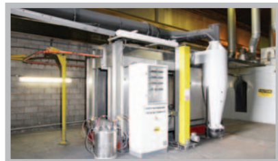
Application booth with control station