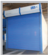
Blast room with doors closed