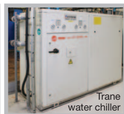
Trane water chiller