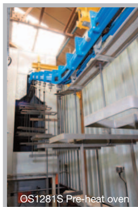
OS1281S Pre-heat oven