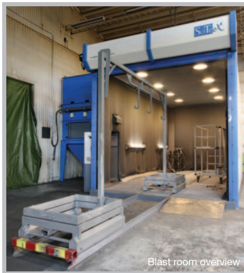
Blast room overview