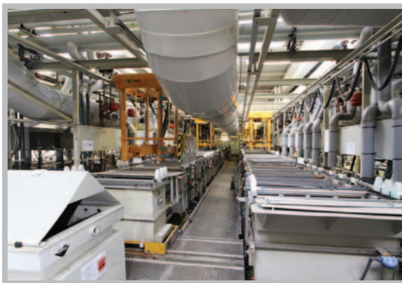
TT077SJ Multi Process Precious Metals Plating Line

Site Clearance Price: prices by negotiation