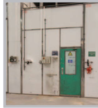
Paint storage and mixing room