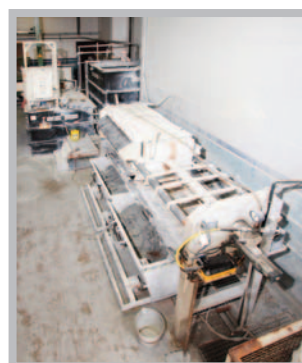
Flocculation & dewatering system