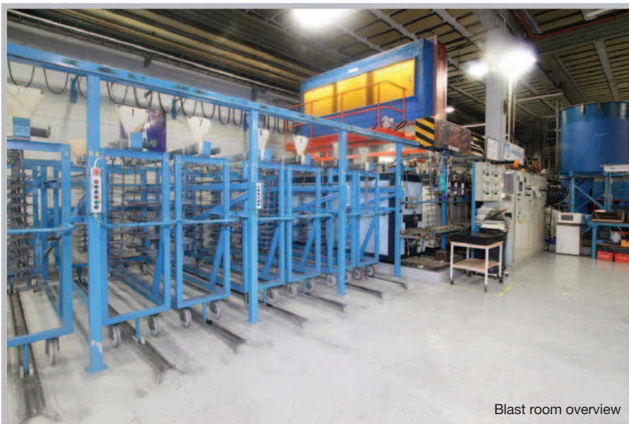
Blast room overview

Combined site clearance price of anodising & effluent plants: £150,000.00 + VAT