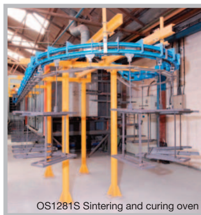
OS1281S Sintering and curing oven