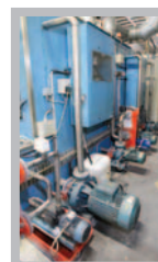
Pumps and filters