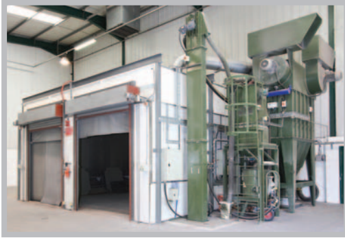
Shot blast room with media recovery and dust extraction