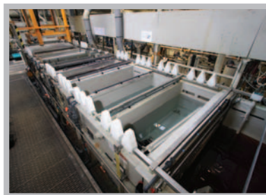
TT077SJ Process tanks