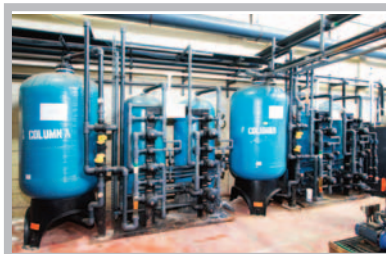
Treatment plant overview