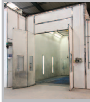
Spraybake painting and curing room