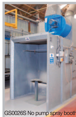
GS0026S No pump spray booth