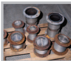
Flexible pipe joints