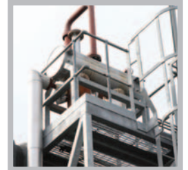
Oil expansion tank