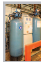
Demin water treatment plant