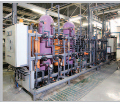
TT081SJ Delta Ultra Pure Raw Water DI Plant