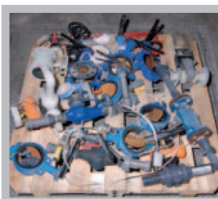
Valves and flow-meters