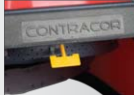
Handle for easy transportation