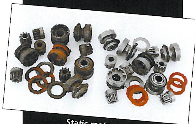
Static motor parts